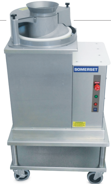
Rounder with Table SDR-400T