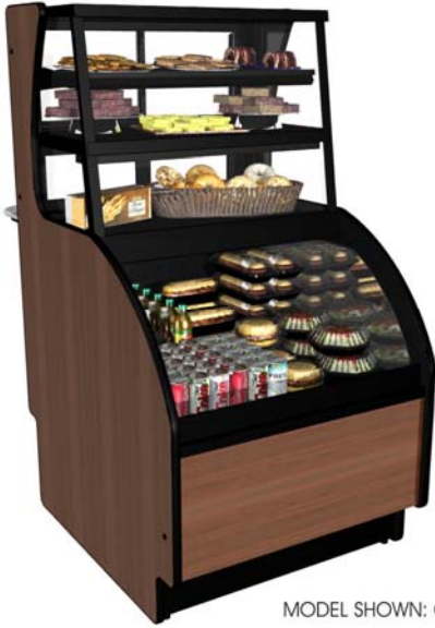
MODEL SHOWN: C3Z3667

36-1/2"L x 41-7/8"D x 67-1/2"H 48-1/2"L x 41-7/8"D x 67-1/2"H