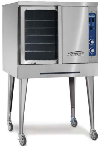
ICVE-1 shown with optional casters

Four bearings per door extend the life of the door mechanism.