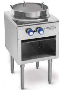
ISP-18-W Tempura Wok Range