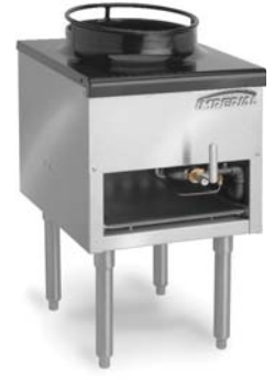
ISP-J-W13 Mandarin Wok Range