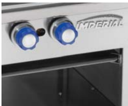
3-ring burner has 2 adjustable gas valves to control inner and outer rings.