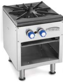
ISPA-18 Stock Pot Range