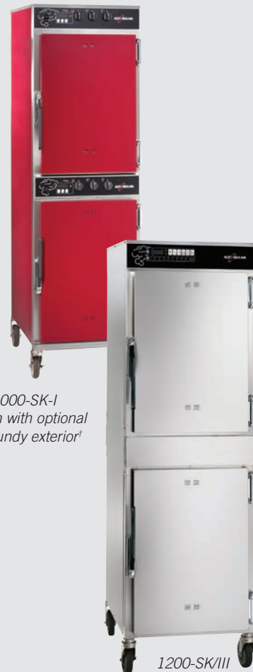
1000-SK-I shown with optional burgundy exterior †