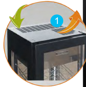
Cold and hot air exchange on top