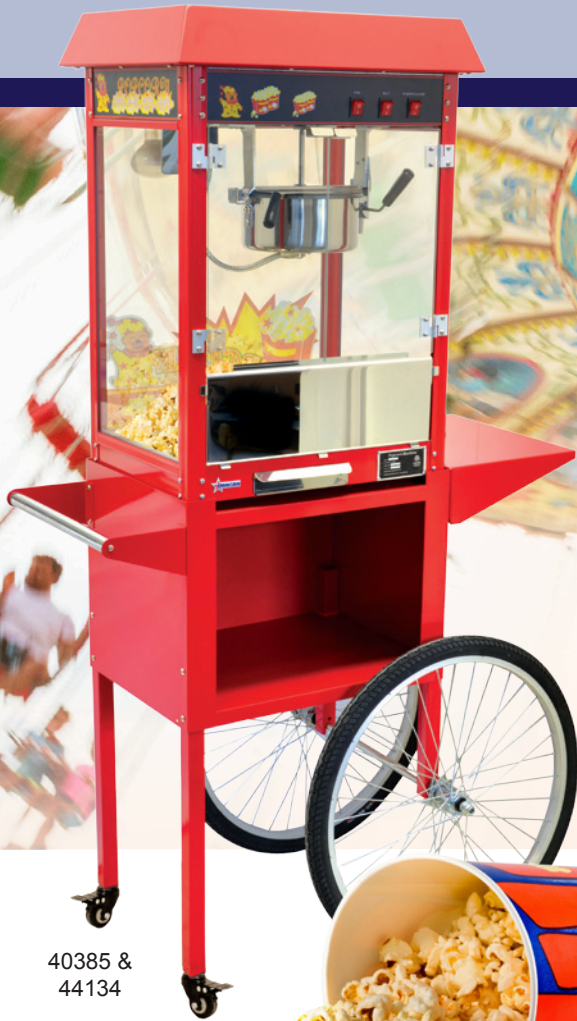
40385 & 44134