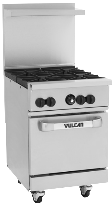
Model 24S-4N (shown with optional casters)