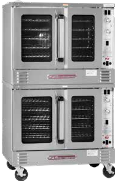
SLGS/22SC shown with optional casters