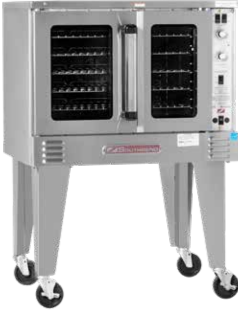
SLES/10SC shown with optional casters