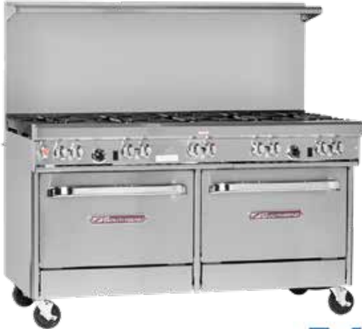
4601DD (shown with optional casters)

Configure your own custom spec sheet and model number at www.BuildMyRange.com . Refer to AutoQuotes for list pricing.