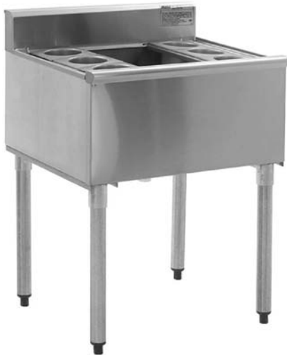
#B2CT-18 cocktail unit

Eagle 1800 Series Cocktail Unit with Sealed-In Cold Plate, model _____. Top, front, backsplash and ice bin to be heavy gauge type 304 stainless steel. Ice bin to be deep-drawn seamless design, fully insulated, with sealed-in 7-circuit cold plate and 1½" drain. 1½" O.D. galvanized tubular legs with welded crossbracing and adjustable bullet feet.