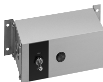
Model RMB-3F with toggle switch and indicator light