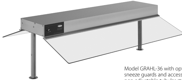
Model GRAHL-36 with optional sneeze guards and accessory non-adjustable tubular stands