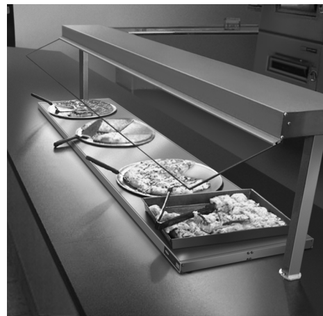
Model GRAHL-66 over a GRS-60-I with optional sneeze guards and accessory non-adjustable tubular stands