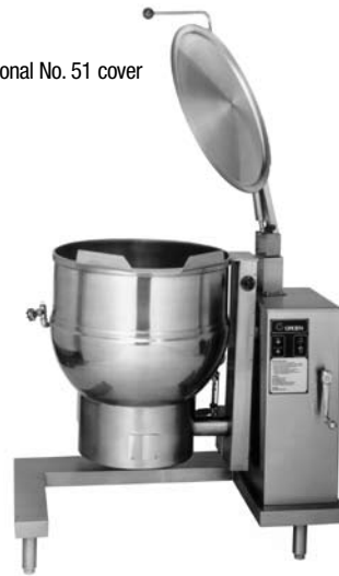
Model DH-40 shown with optional No. 51 cover

WATER indicator light, and HEATING light are mounted on the kettle support side console. Gas supply shall shut off automatically when unit is tilted.