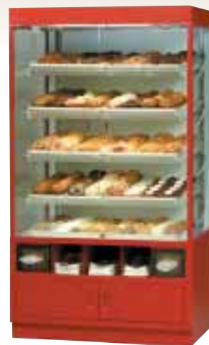
Full-Pan Wall Display, Non-Refrigerated Self-Serve Bakery Case – WDC4276SS: Fresh solutions to your bakery merchandising needs