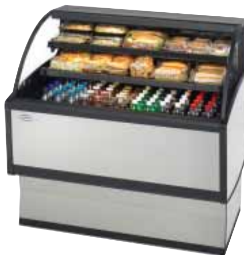
Refrigerated Self-Service Low Profile – LPRSS: “Grab-and-go” display brings the product to the customer