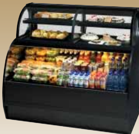
Convertible Service Over Refrigerated Self-Serve: Display a variety of products with presentation in mind