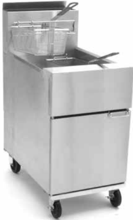
SR162G Shown with optional casters.