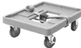
CD400 (Shown with Optional Strap)