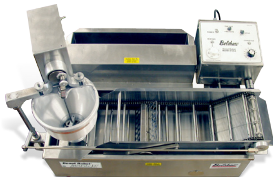
Donut Robot® Mark II GP Gas