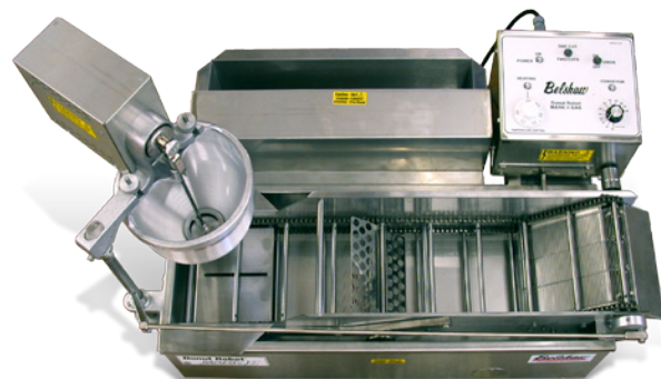
Donut Robot® Mark II Gas