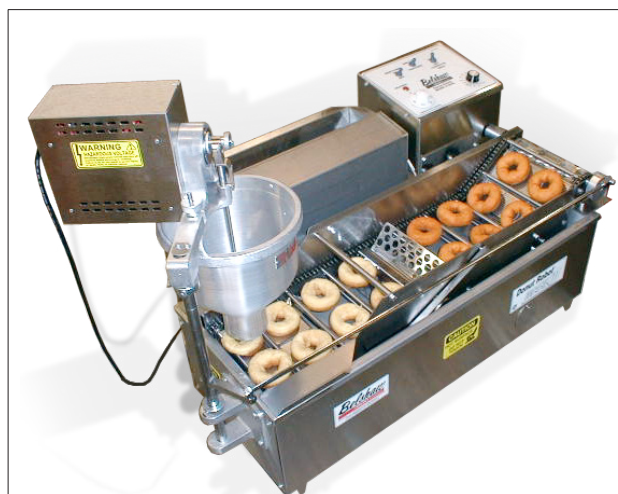
Donut Robot® Mark II Gas with Donuts