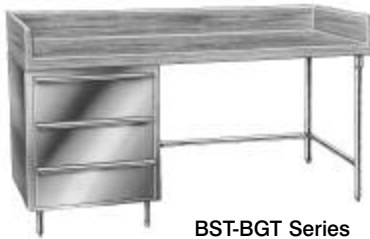
BST-BGT Series with 3 Tier Drawers

FOR MAPLETEX TABLES WITH COVED RISERS, PLEASE CONSULT FACTORY