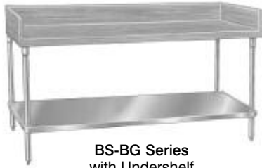
BS-BG Series with Undersheff