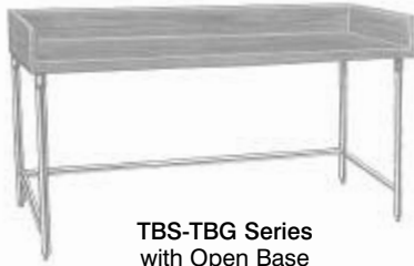
TBS-TBG Series with Open Base